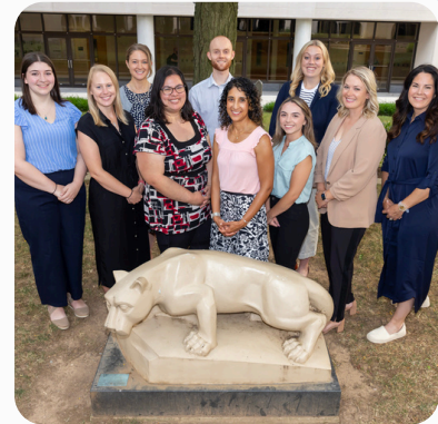
Penn State PRO Wellness WSCC Award