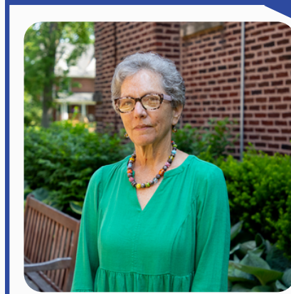
Rochelle Davis Howe Award

Congratulations to our 2024 award winners!